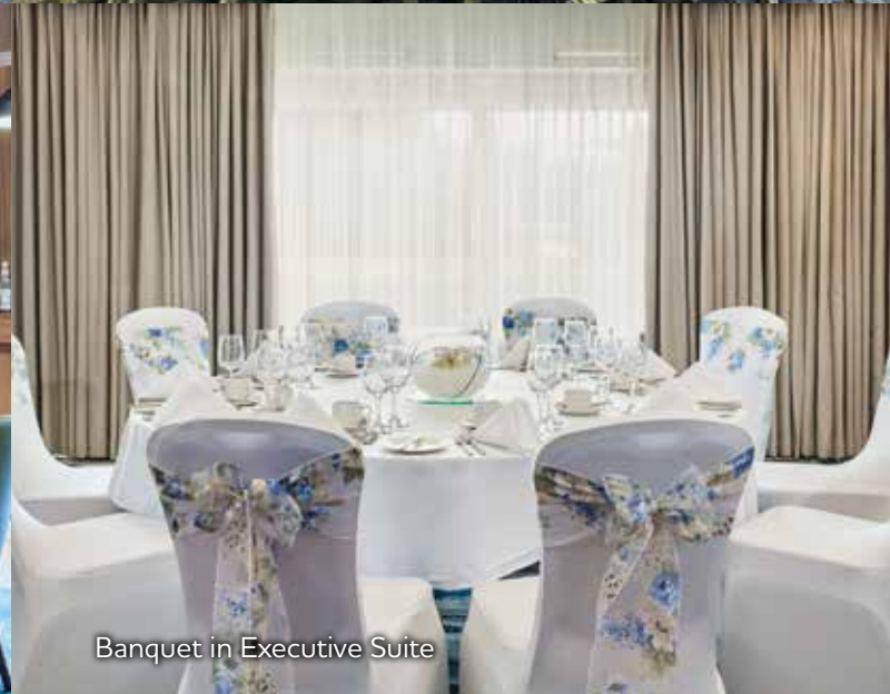
Banquet in Executive Suite