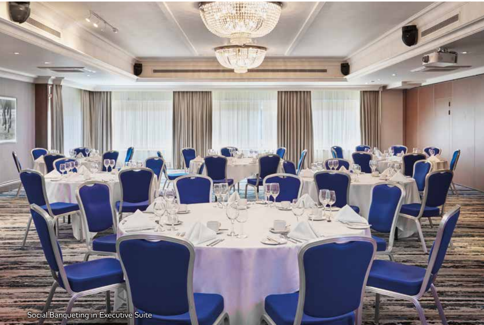
Social Banqueting in Executive Suite

Our largest ground floor conference and event room is the premier venues for gala balls, charity events and celebrations and can accommodate up to 320 guests for banquets. The Executive Suite has built in screens and projectors and also has its own private bar.