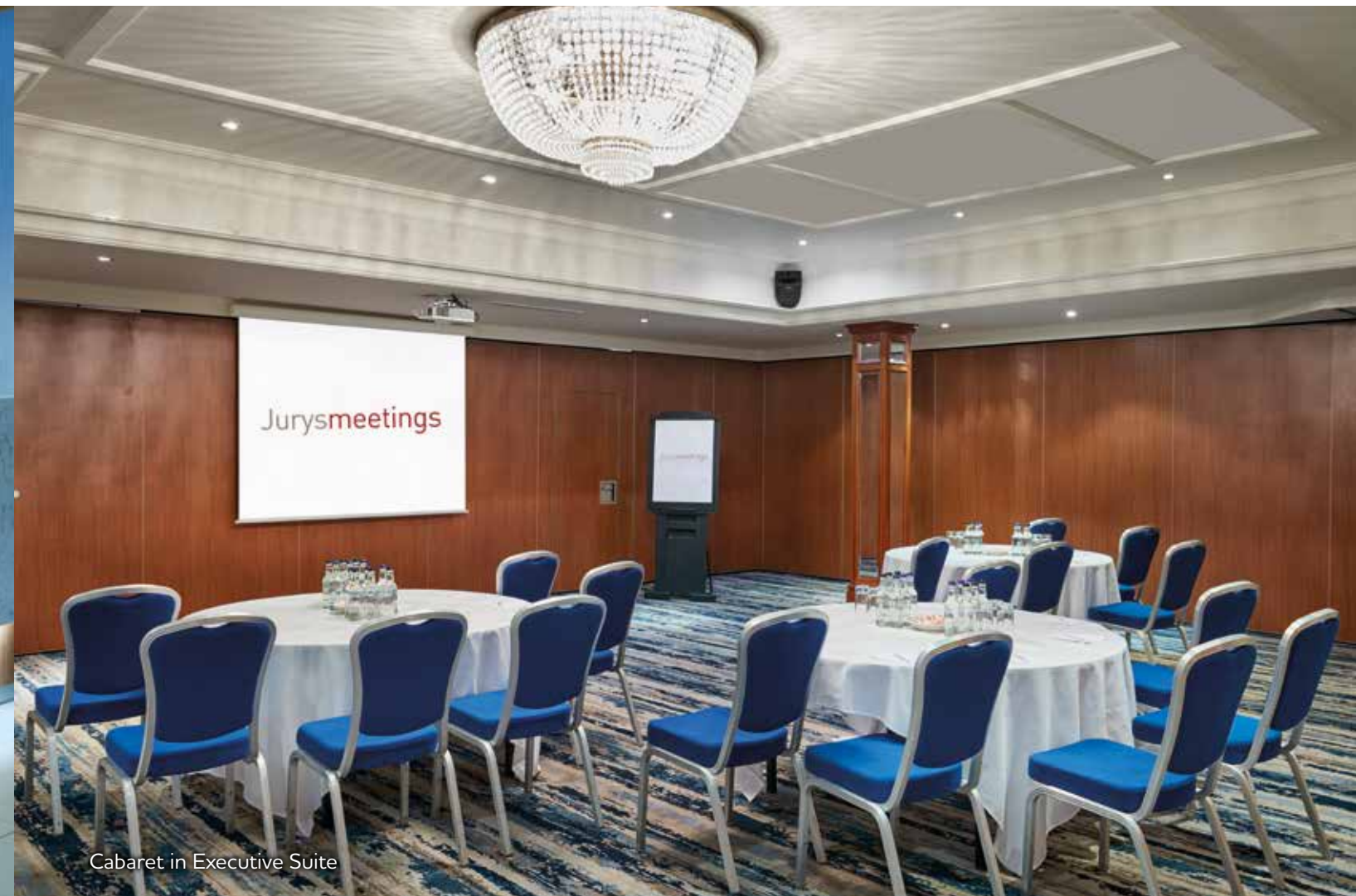
Cabaret in Executive Suite