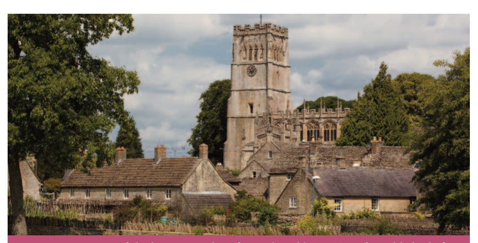
Northleach is one of the best examples of a medieval 'New Town', established after the Norman Conquest. Its location midway between London and Wales, and Oxford and Cheltenham, soon saw it become a major staging post. At one time there were 20 coaching inns here. The centre has hardly changed since the 1500s. Take time to explore on foot and soak up the atmosphere.