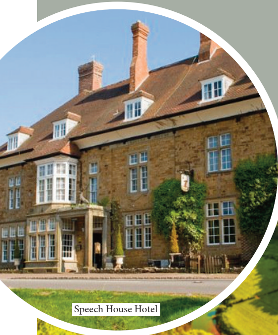
Speech House Hotel

Cycling and Walking Tours: Throughout the Cotswolds from a range of companies including Active England Tours, Carter Company, Hikes and Bikes, Compass Holidays and Wild Carrot .