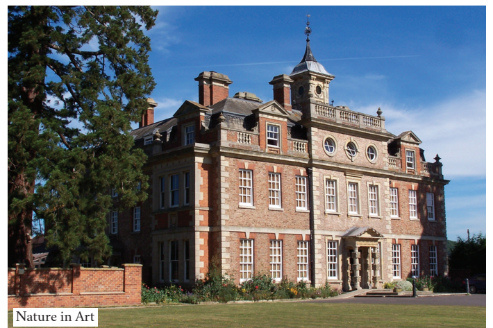
Nature in Art

■ The Ostrich: A lovely scenic old pub situated in Newland, a beautiful village which lies on the western edge of the Forest of Dean and adjoins the Wye Valley, both areas of outstanding natural beauty.